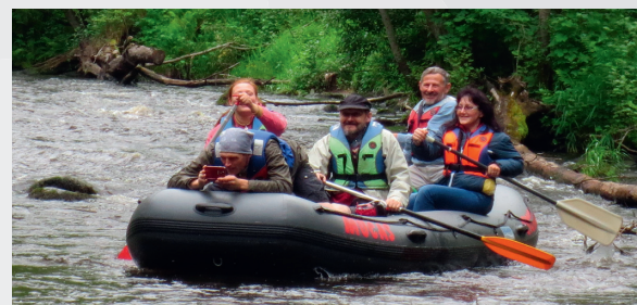
Boaters on River Brasla